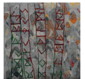
Runic Figures, 2018 Inspiration: Viking runes Dovecot Studios Woven by David Cochrane