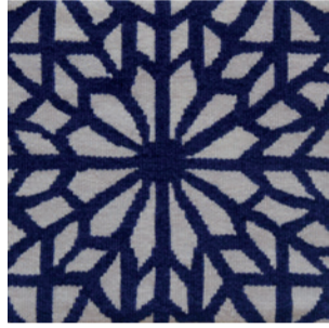
Moroccan Tile, 2018 Inspiration: Islamic pattern Dovecot Studios Woven by Emma Jo Webster