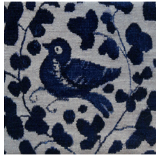
Arabesco Bird, 2018 Inspiration: Italian ceramic Dovecot Studios Woven by Emma Jo Webste