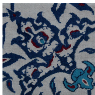
Iznik Tile, 2018 Inspiration: Turkish ceramic Dovecot Studios Woven by Naomi Robertson