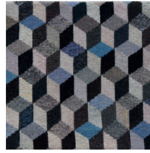
Reversible Cubes, 2019 Inspiration: Ancient Greek mosaic Dovecot Studios Woven by Ben Hymers