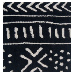
Monochrome Mud Print, 2018 Inspiration: African pattern Dovecot Studios Woven by Emma Jo Webster