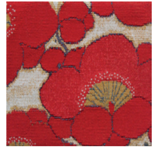
Anemone, 2018 Inspiration: Japanese fabric Dovecot Studios Woven by Emma Jo Webster